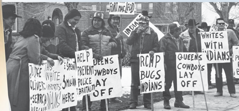
ABOVE: "Court house demonstrators claim to support hotelier," March 30, 1983.

Through a combination of archival sources, newspaper articles, and oral history interviews, this exhibition portrays the American Hotel and its history as a contact zone over the course of the 1950s to the 1980s through different owners, exploring patron interactions, and examining police surveillance.