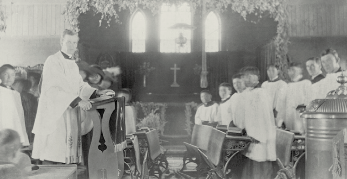
LEFT: Service at St. Paul's Anglican mission, Blood reserve, Alberta, ca. 1910s