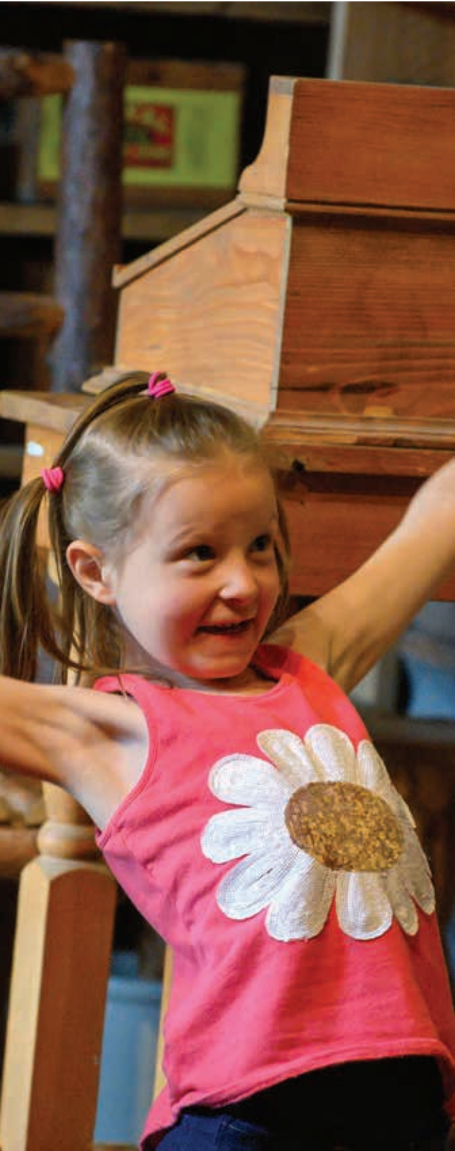
Students visit the fort for a school program.