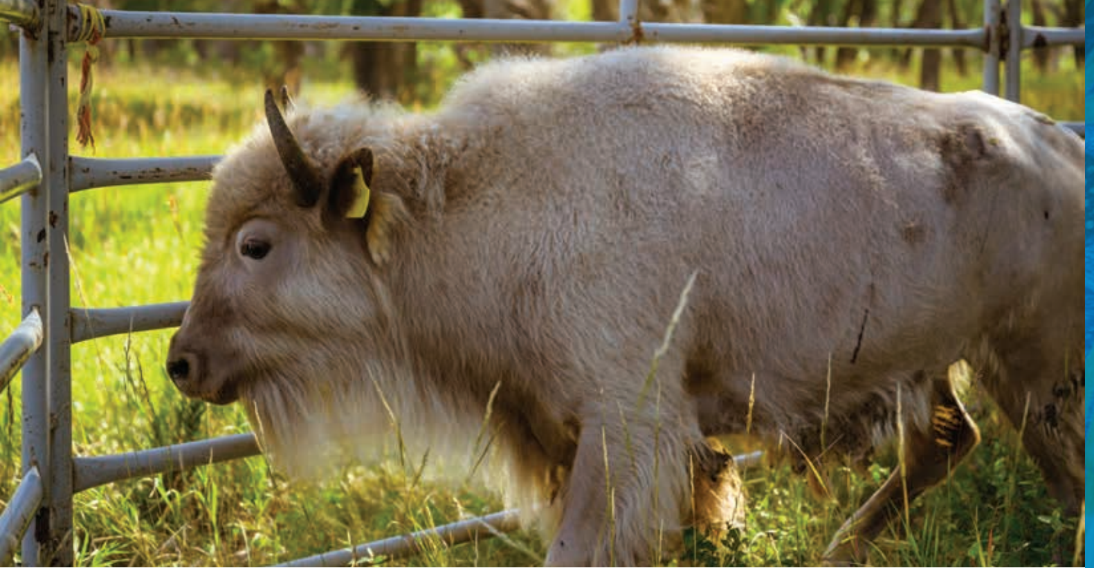
Buffalo in a fence on harvest day.