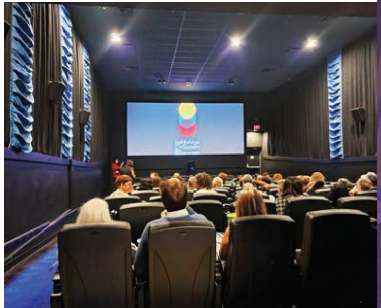
Festival film screening at The Movie Mill cinema.

Festival attendees were treated to a red carpet experience at both the Galt and the Movie Mill.