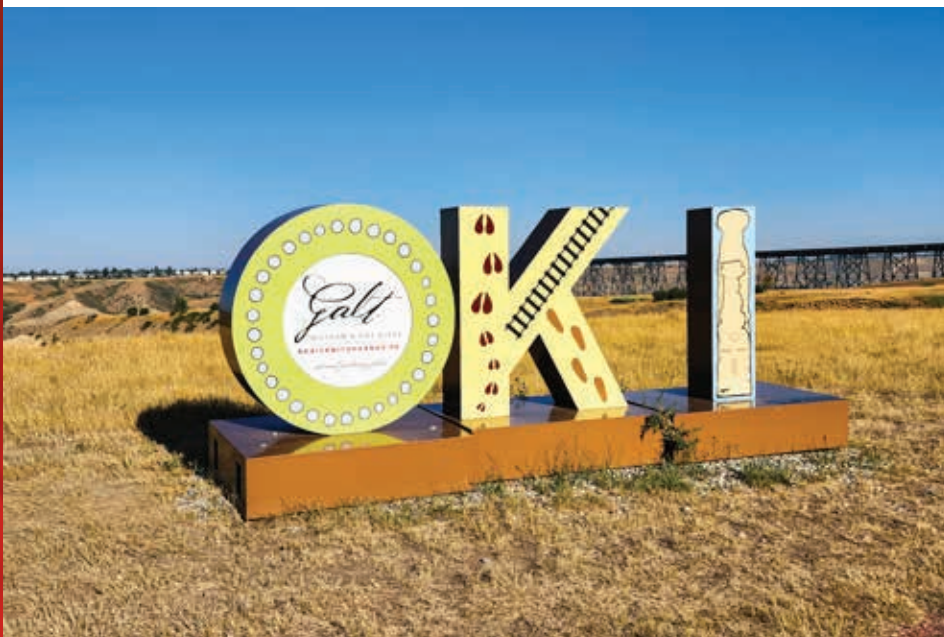
Above: The Oki sign outside the Museum.