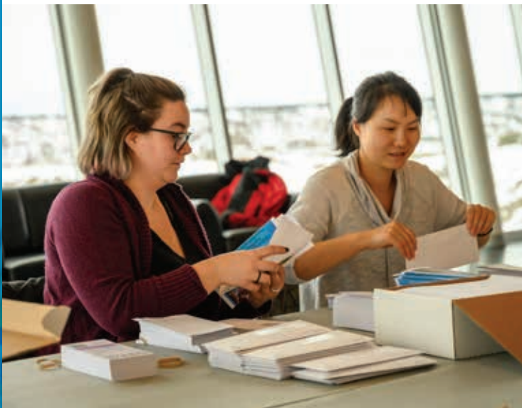
Volunteers assemble materials for mailing.