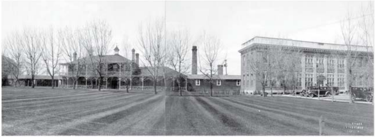
Hospital complex, 1925.

The population in Lethbridge steadily increased as more people moved into the area after the turn of the 20th century. More hospital beds were required so an addition was constructed to increase the capacity of the 1891 hospital to 65.