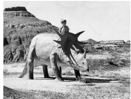
Small boy on Ceratopsidae type dinosaur sculpture, ca.1975.

Since cameras arrived on the western plains, photographers have captured exciting and dramatic subjects through their lenses. The images and documents on exhibit reflect the land in southern Alberta where dinosaur fossils are found, the people who dig and study dinosaur remains, and the fascination people have with dinosaurs - even the concrete variety. This exhibit represents a small selection of images and articles from the 1880s to more recent times, all from the Galt Museum & Archives.